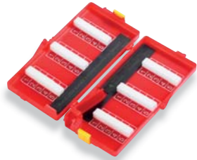
17. 31142451 Double foam strips with blade remover