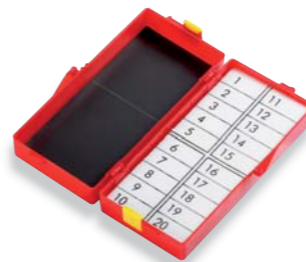
6. 31142493 Foam block with single black magnet