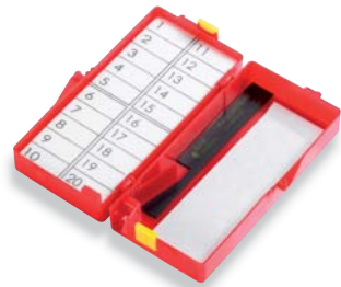
4. 31142360 Foam block with adhesive strip and blade removal