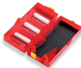
24. 31313425 Single foam strips with single magnet