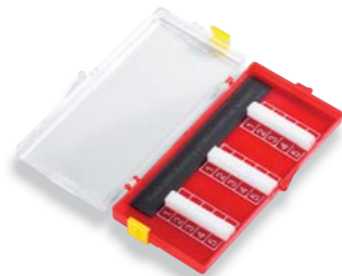
21. 31142212 Single foam strips with clear top