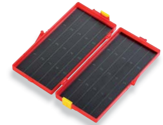
12. 31142147 Double black magnet