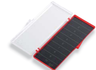
15. 31142410 Clear top, single black magnet