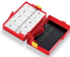
3. 31142394 Foam block for small counts with single magnet and blade removal