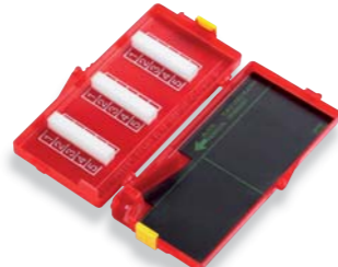
18. 31142295 Single foam strips with magnet and blade remover