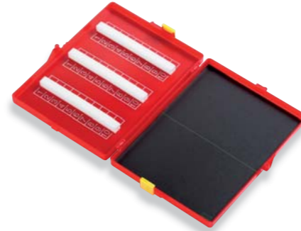
19. 31142188 Large foam strips with double black magnet