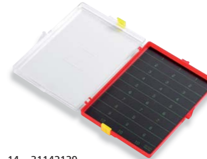
14. 31142139 Clear top, single black magnet