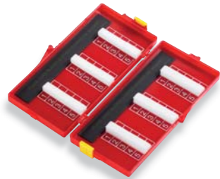
20. 31142303 Double foam strip