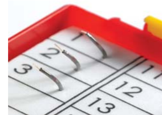
High density foam block ensures needle retention