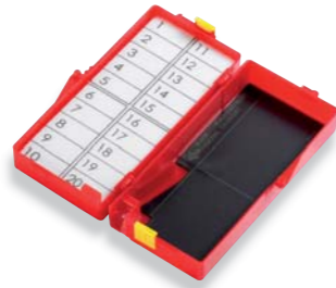
2. 31142386 Foam block with single magnet and blade removal