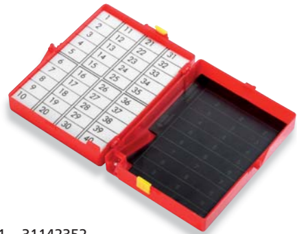
1. 31142352 Foam block with numbered magnet maximum 100 count and blade removal