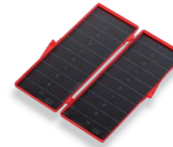
13. 31142196 Double black magnet