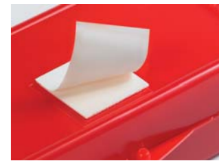
“peel off” adhesive backing for securing