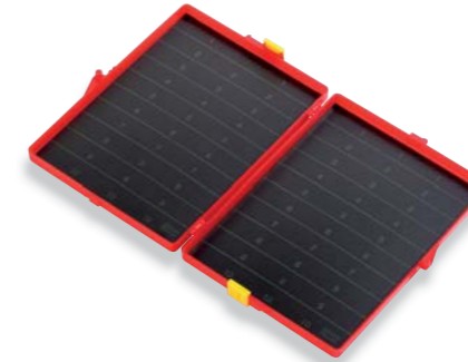
11. 31142154 Large double black magnet