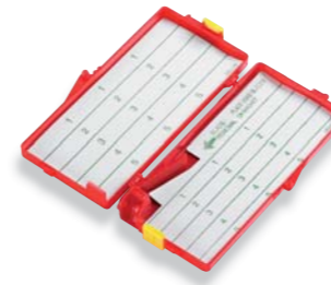
16. 31142238 Double white magnet with blade removal