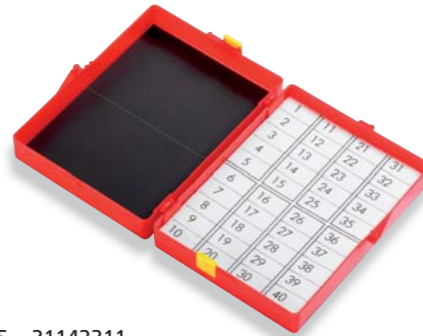
5. 31142311 Foam block with double magnet