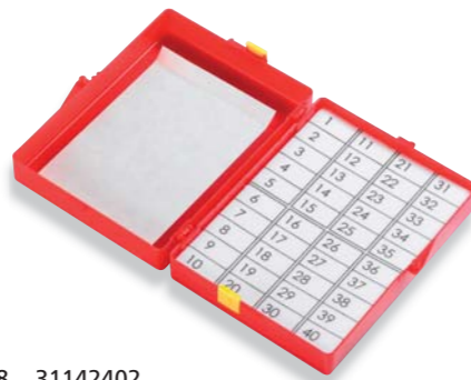
8. 31142402 Foam block with adhesive strip