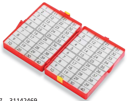
7. 31142469 Double foam block (maximum 80 count)