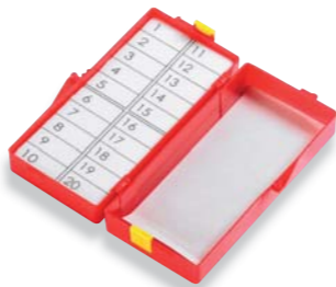
9. 31142501 Foam block with adhesive strip