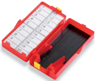
22. 31181459 Single foam block with magnet