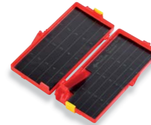
10. 31142113 Double black magnet with blade removal